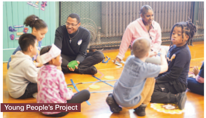
Young People's Project

The YPP provided Math Playground experiences for Kindergarten through 6th-grade students at the Roger Clap School in Boston, including competitive and collaborative games and activities such as exploring even and odd numbers, prime and composite numbers and probability. The goal is to transform students' relationships with math. The YPP also presented games at "Jinny Chalmers Day," giving high school youth an opportunity to facilitate math games with all ages.