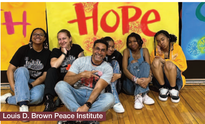
Louis D. Brown Peace Institute