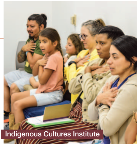
Indigenous Cultures Institute

colleagues use Xinchtlhi pedagogy at Raíces del Saber Community School in Las Cruces, NM, and with New Mexico educators who participated in the ICI's Tanko Institute: Xinchtlhi Pedagogy for Educators in San Marcos, Texas.