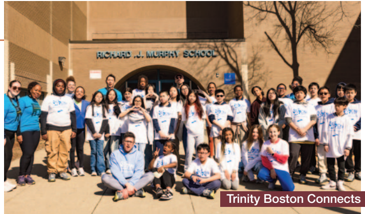
Trinity Boston Connects