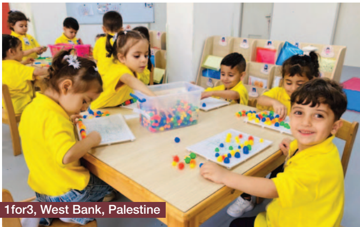
1for3, West Bank, Palestine

The Jinny Chalmers Fund supported the strengthening of trauma-informed approaches at the Zahrat Al Yasmeen (ZAY) kindergarten this year through both classroom and experiential learning. The school is located in the Aida Refugee Camp in the occupied West Bank. The children planted and cared for seasonal crops in the school garden, giving them agency and autonomy. A new ZAY social worker provided support for both students and families, and an international team of educators and social workers supported the school staff, who are doing everything humanly possible to create safe and nurturing spaces for children to learn, heal and thrive.