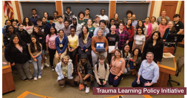
Trauma Learning Policy Initiative

The TLPI's Students Speak initiative, with the support of JCFEJ, has launched a Youth Leadership Team (YLT) to advance the goal of fostering a youth movement for improving schools by including student voices in school-based decision making. Participants learn about the common barriers they face, underlying systemic conditions—and brainstorm advocacy actions to address them. In April, a YLT Youth Summit for young people from across Massachusetts led to identifying a legislative advocacy agenda.