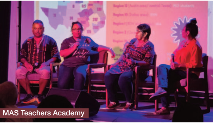
MAS Teachers Academy