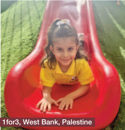
1for3, West Bank, Palestine

We are especially proud to present this year's report on the work of the Jinny Chalmers Fund. We continue to grow, with new grantees and a strong base of supporters. We continue to spread the word about our priority: to center families and educators and work to make schools and communities places where all are recognized as contributing, valued and integral members.