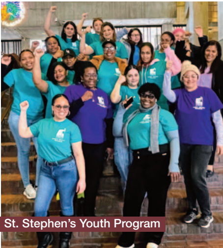
St. Stephen's Youth Program

power to insist that the City of Boston's decision-makers uphold their promises for better public schools and neighborhoods. A Jinny Chalmers Fund grant allowed stipends for eight members of SSYP's peer-elected Action Committee, which led over 150 parents and family members to take collective action for education justice.