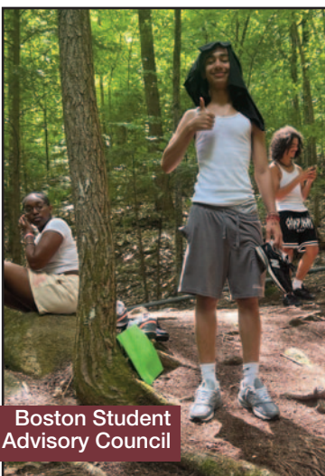
Boston Student Advisory Council

With support from the Chalmers Fund, First Teacher was able to deepen programming at an alternative high school in Boston, working collaboratively with parents and expectant parents who are high school students. The program helps increase parents' self-esteem, confidence and capacity in their role as their child's most important brain-builder. And First Teacher helps students meet graduation requirements while having fun. Plans are underway for further expansion of the program.