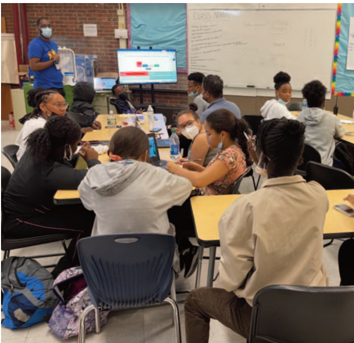
The Young People's Project, Inc.

Learn more about The City School- Pathways to Change