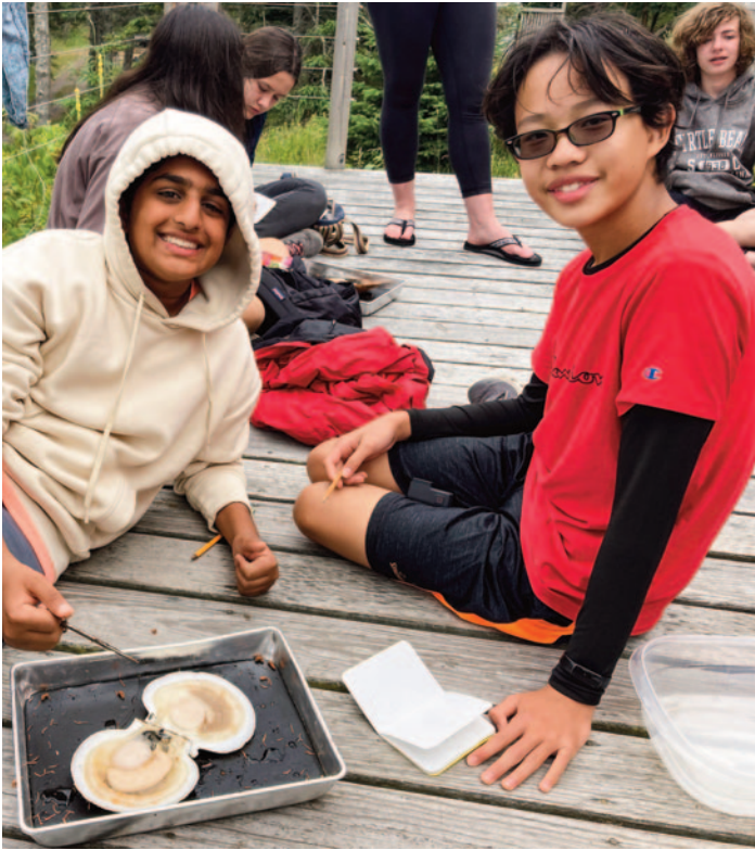
Boston-area students at Hurricane Island