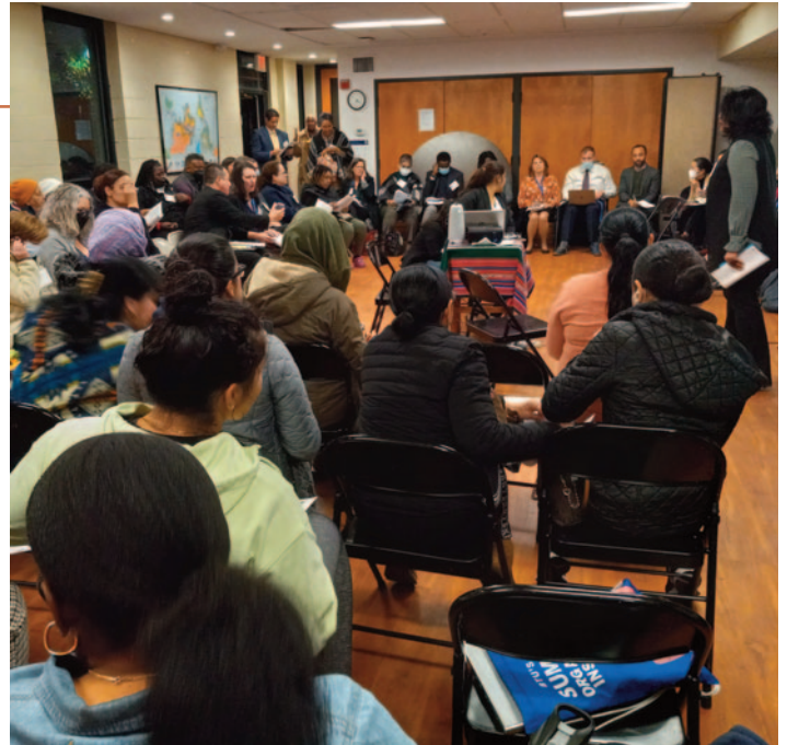
St. Stephen's Youth Program parents meet with Boston Schools officials.